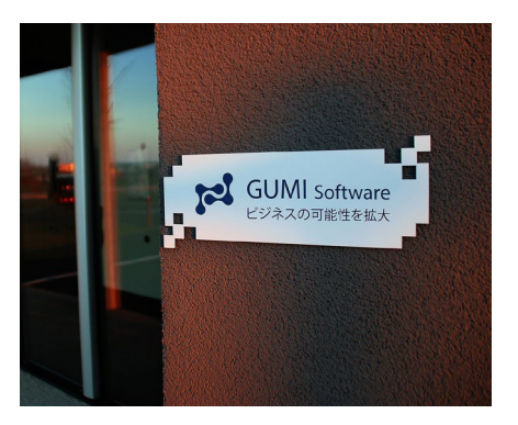
POP displays and sign engraving