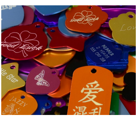
Pet and dog tags engraving