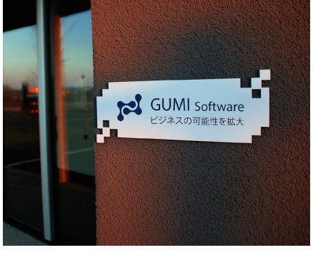
POP displays and sign engraving