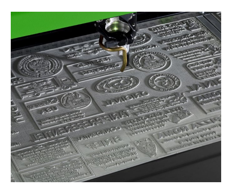
Engraving & laser cutting of custom ink stamps