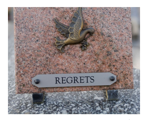
Funeral plaques and headstones engraving