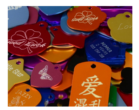
Pet and dog tags engraving