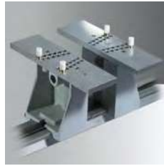
Cutlery jigs with relocatable pins Ref. 22370