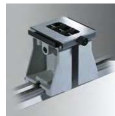
Perfect for baby identity bracelets Ref. 22870