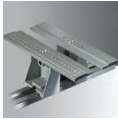
Aluminium jigs 240 mm (9.5") Ref. 21131