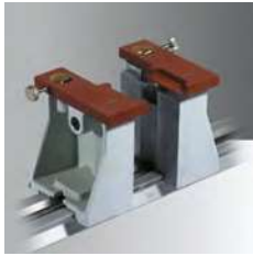
Spectacle bow jigs adjustable width Ref. 20190