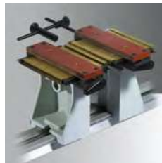
Multigrip jigs with sliding pins & stops Ref. 20196