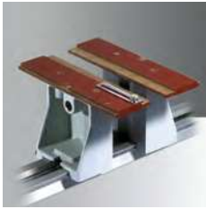
Standard celeron jigs 150 mm (5.9") Ref. 10165