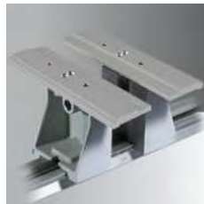
Funeral plate jigs for M20 164 x 50 mm (6.5" x 2") Ref. 47697