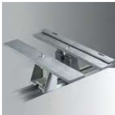
Circuit board jigs with locating pins Ref. 16638