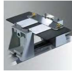
Gravofoil™ vice Ref. 22868