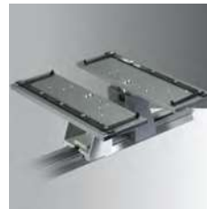
Large plate/salver jigs with relocatable pins Ref. 20192