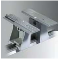
Aluminium jigs 150 mm (5.9") Ref. 20189