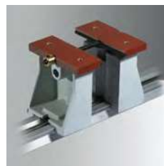
Signet ring jigs with protection pad Ref. 20194