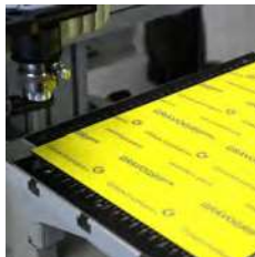
Gravogrip™ Several sizes available. Please contact us for more details. See p.13.