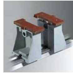
Pen & tubular object jigs Ref. 10169