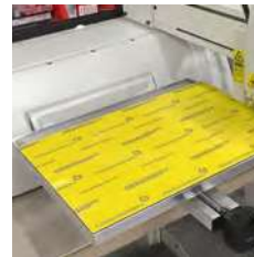
Support table + Gravogrip™ Ref. 71116 for IS200 Ref. 45697 for M40