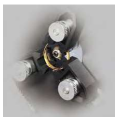
Jigs for wedding rings Réf. 12500