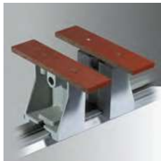
Celeron unmachined jigs 152 x 38 mm (6" x 1.5") Ref. 10179