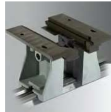
Cell phone jigs Ref. 49510