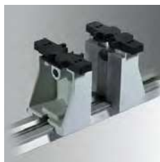
Watch/medal jigs fits any shape Ref. 10182