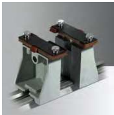
Clip pen jigs Ref. 20842