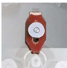
Jig for ring with large stone Ref. 30050