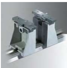
Jigs for jewellery, bracelets and medals Ref. 28192