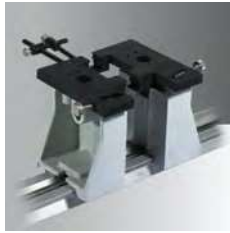
Cutlery jigs with adjustable stops Ref. 20129