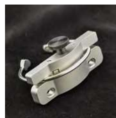
Jigs for bracelets Réf. 77961