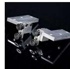
Jigs for rigid bangles Ref. 51729