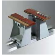
Celeron badge jigs 103 x 36 mm (4" x 1.4") Ref. 20128