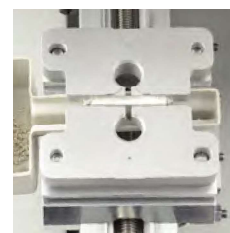
Jigs for bracelets and pendants Réf. 77320