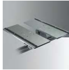
Large plate, aluminium jigs 310 x 110 mm (12" x 4") Ref. 20191