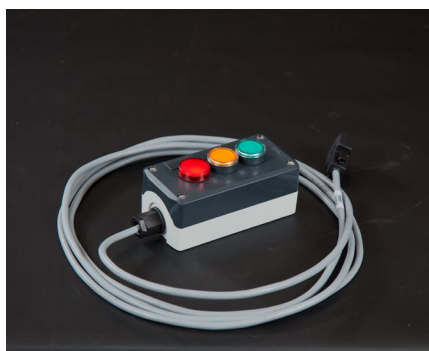
Process Control Box