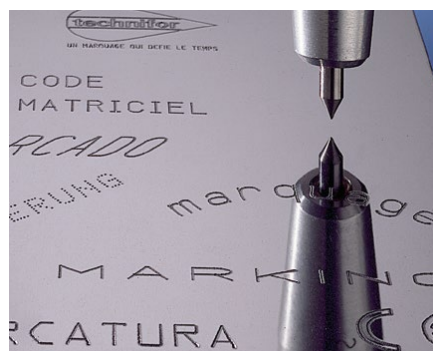
Stainless steel marking