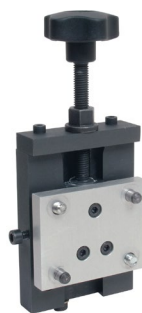
Head Adjustment Device