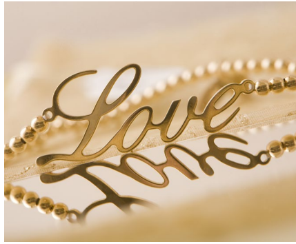
Cutting & engraving