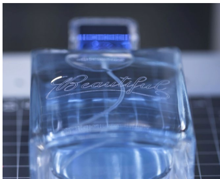
Cosmetics & luxury