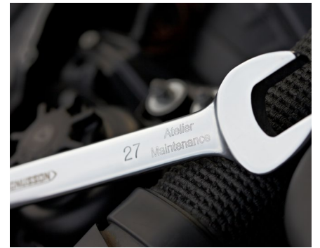
Marking tools for identification and equipment traceability