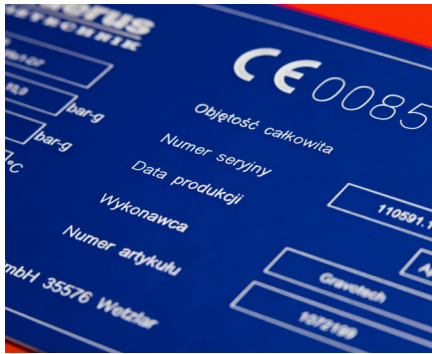
Traceability of industrial parts