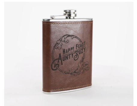
Gifts & personalization