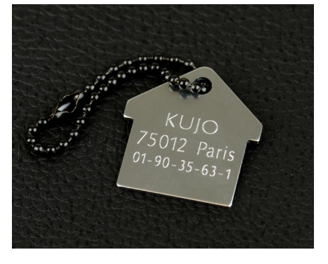
Pet and dog tags engraving