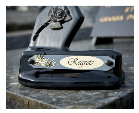
Funeral plaques and headstones engraving