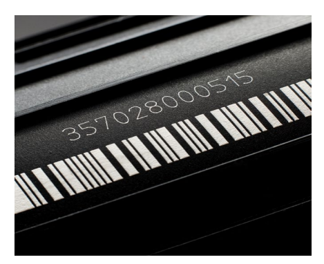
Contrasted marking on plastic