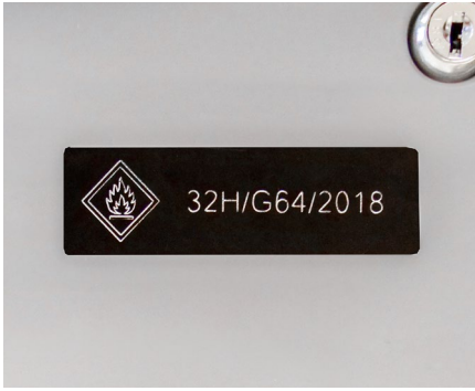
Marking tools for identification and equipment traceability