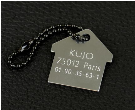
Pet and dog tags engraving