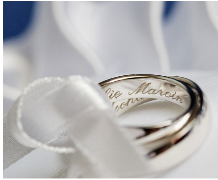
Personalizing and engraving jewelry