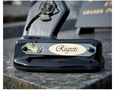
Funeral plaques and headstones engraving