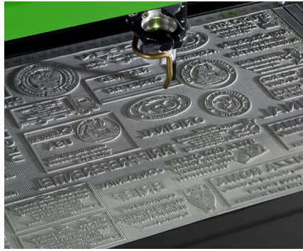
Engraving & laser cutting of custom ink stamps